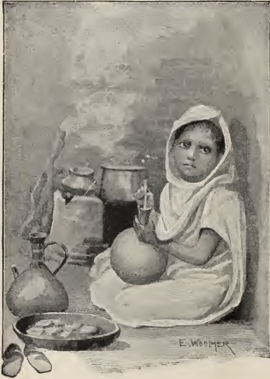
A CHILD WIDOW